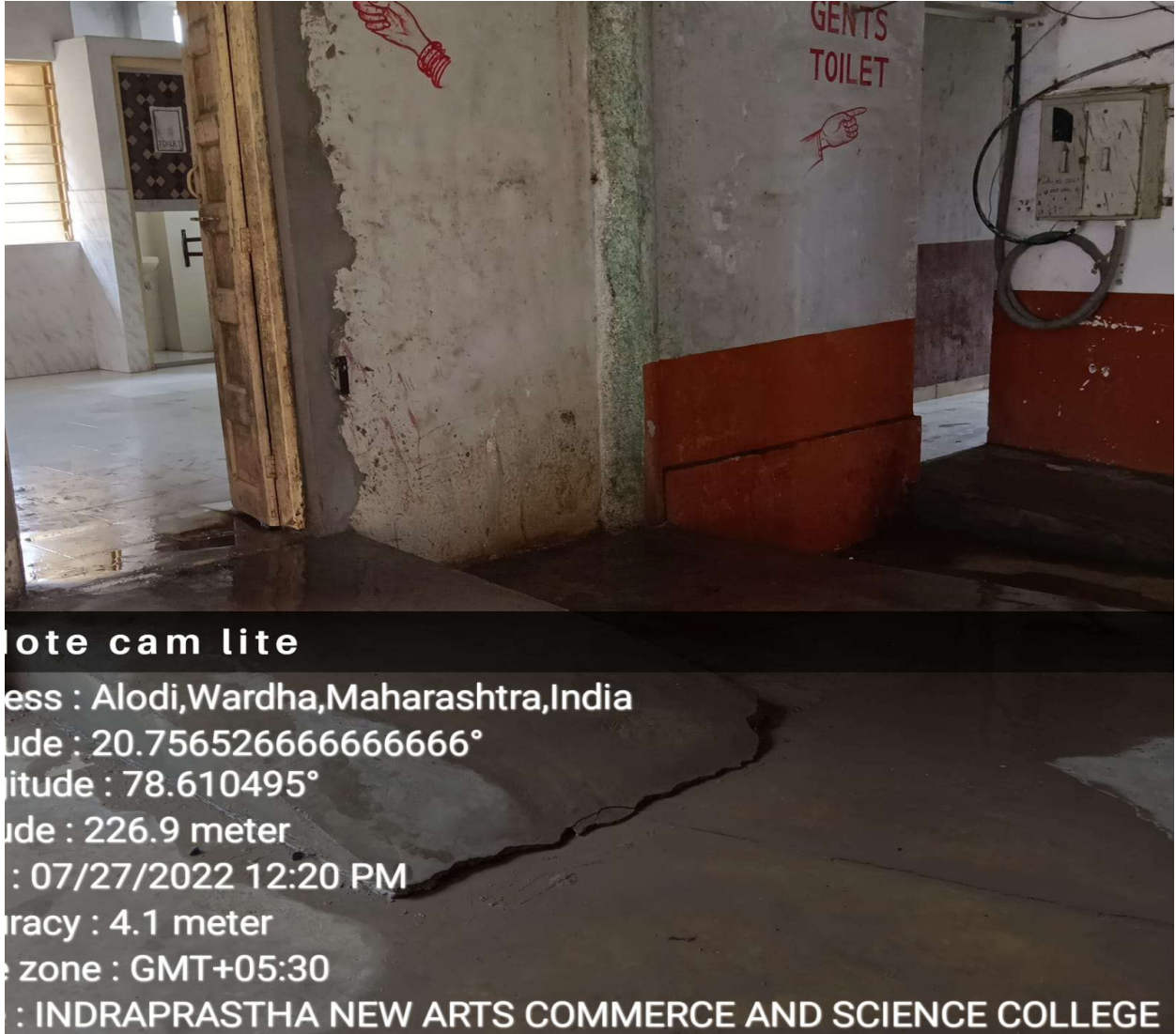
a. Disabled-friendly washrooms